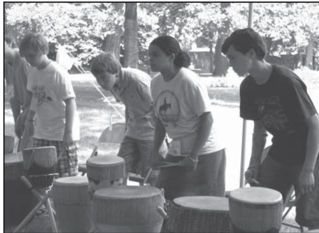
Finding the Beat: 2007 Lew Wallace Youth Academy students learn how to play authentic African drums.

Exploring Other Cultures: Participants will learn about Lew and Susan Wallace's world travels finding objects they collected in the Study. Next, they will get a chance to experience