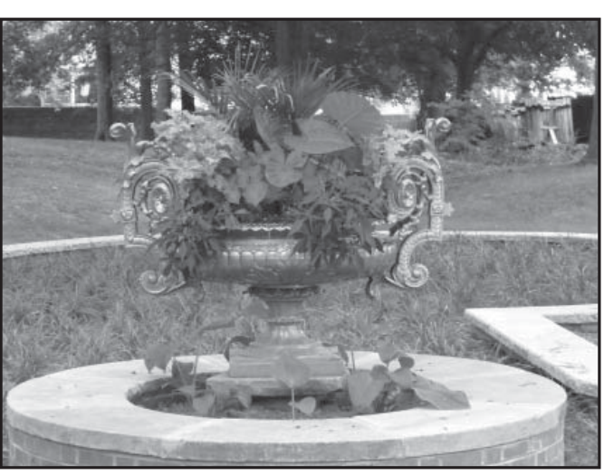
The Reflecting Pool urn

The TASTE of Montgomery County! was a contrast in weather. The morning of he TASTE! saw torrential downpours. It very quickly became apparent that the vendors' vehicles, filled with delicious samplings, were experiencing problems with traction. Mud and puddles became the norm during setup. Thankfully, two 'gators', (4-wheel-drive utility vehicles) on loan from Craw-