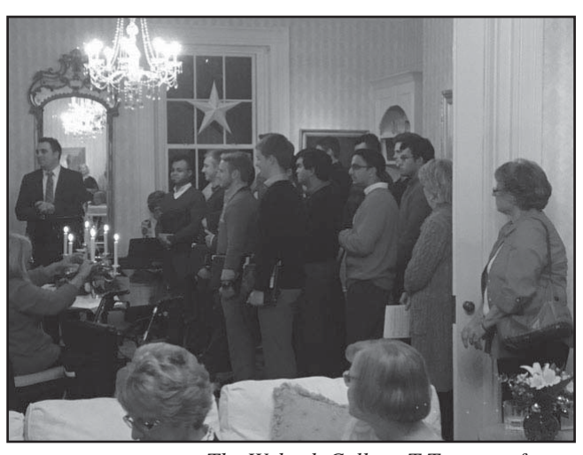
The Wabash College T-Tones perform at the 2017 Holiday Tea

"In addition to our sponsors, the museum is fortunate to have such willing and generous organizations, including the Montgomery County Historical Society, Wabash College, and other local businesses,