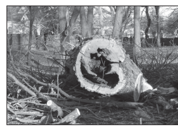
A large sassafras tree near the statue had to be removed earlier this year. It was completely hollow!

The Crawfordsville Parks and Recreation Department will be planting trees in additional parks. Check in with our Facebook page for more Arbor Day activities.