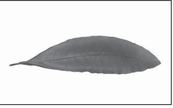
Shingle Oak leaf

The study has three species of hickory trees. A mockernut hickory, misidentified in our previous inventory, is really a pignut hickory, according to the arborist. The pignut and the bitternut hickories have