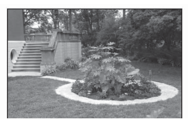
The Moat Garden planted with lilyturf, coneflowers, bee balm, candytuft, castor beans, and colorful annuals

A new decade presents new challenges. Mature trees declining in health, tree replacement, planting perennials and maintenance of the arboretum and gardens of the Study require basic needs. Understandably, funding for grounds and gardens are generally at the bottom of budget proposals. New and creative ways of funding are required for large and small museums.