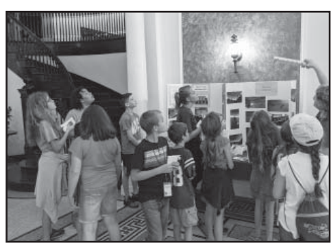
ArchiCamp Participants in 2019 take a closer look at the architecture of the Masonic Temple

local buildings from cardboard boxes, learn about careers in historic preservation, and discuss