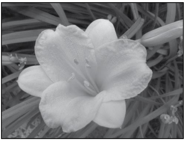
Stella de Oro daylilies