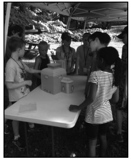
ArchiCampers work together to put together a model of the Study

On Tuesday, students went on a walking tour of Elston Grove, learned about different styles of houses, and received a behindthe-scenes tour of the Study building. In the afternoon, the