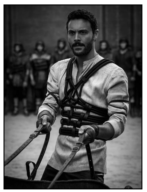
Movie still from the 2016 Ben-Hur movie showing Jack Huston as Judah Ben-Hur

from 47 states and almost a dozen countries have come to Crawfordsville because they have been inspired by Wallace