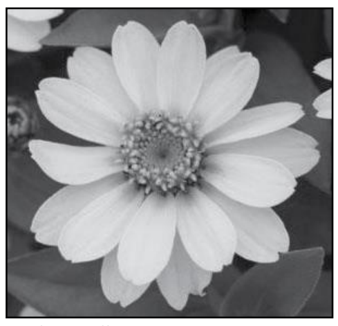
Zahara Yellow zinnias

This year, many of the iris have gotten some long overdue