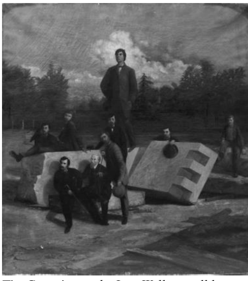
The Conspirators by Lew Wallace will be included in the conservation assessment

The Indiana Historical Society's Heritage Support Grant is