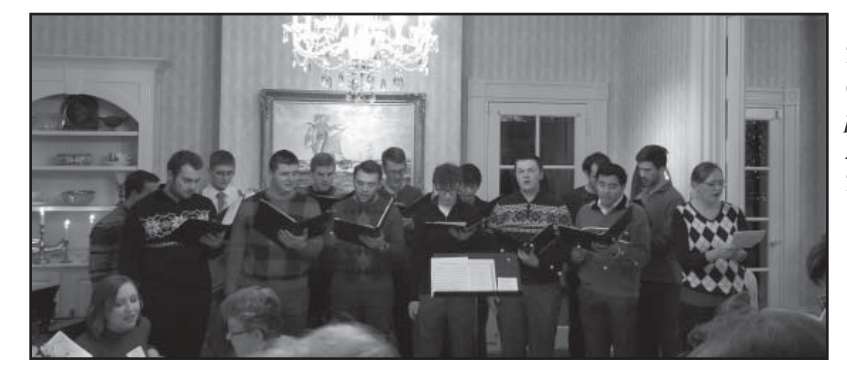
The Wabash College T-Tones perform at the 2019 Holiday Tea

5: 15 p.m. Live holiday music with the Wabash College T-Tones