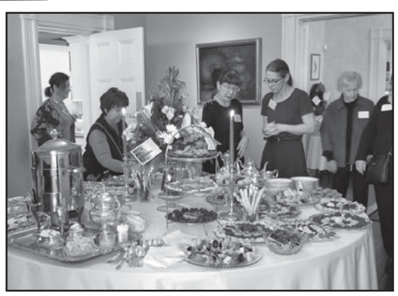
Tea attendees enjoy the sweet and savory treats served at the 2019 Holiday Tea

the Holiday Season." This event allows ticket holders a rare chance to see one of