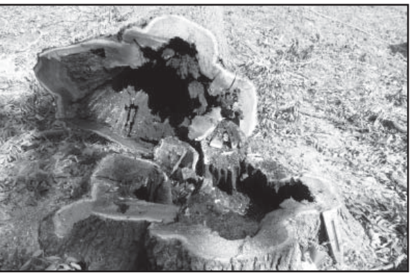
Hollow trunk of a walnut tree

During the removal of a tree of heaven (Ailanthus altissima), a large ACTIVE beehive was discovered in the upper portion of the tree. An inquiry to the Beekeepers of Indiana provided the Museum with the name of an