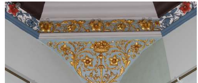
A close-up of the 23k gold leaf on the plaster frieze. The gold leaf had to be reproduced rather than restored.