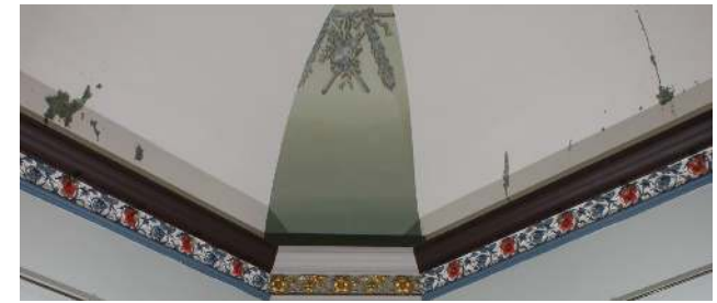
The uncovered portion in center, with later paint finishes to right and left.

Plans call for the completion of the interior restoration by Summer 2015.