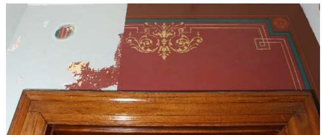
A reproduction of the paint finish uncovered in the Study vestibule.