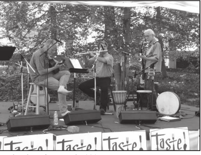
Nuthatch performs at the 2015 Taste

the "Sign Up Genius" button. We also invite you to help us spread the word by joining our Street Team. Visit the Street Team page on our website for images that can be shared on Twitter, Facebook,