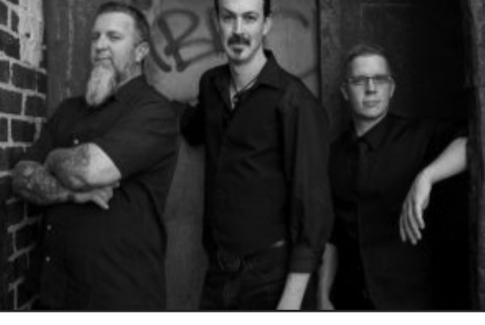
cont. on page 4