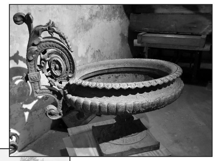
Above: The original urn from the central island of the reflecting pool. It is missing one handle and is now stored in the basement of the Study.

large oval cast-iron urn. The urn was filled and planted with a variety of plants and flowers. The Museum is scouring the internet and antique shops and talking to historic contacts in search of a reproduction of the urn. The soil will be returned to the pool, leaving a portion of the wall and capstones visible, and the interior will be planted with groundcover.