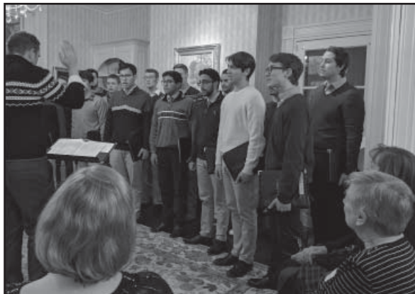
The Wabash College T-Tones perform at the 2018 Holiday Tea

Reservations for the Holiday Tea & Fashion Show are $25 per person and due by December 4. To reserve places for you and your guests, call the General Lew Wallace