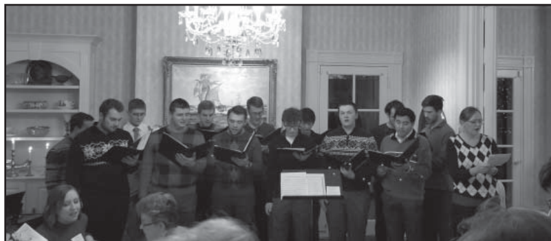
The Wabash College T-Tones perform at the 2019 Holiday Tea