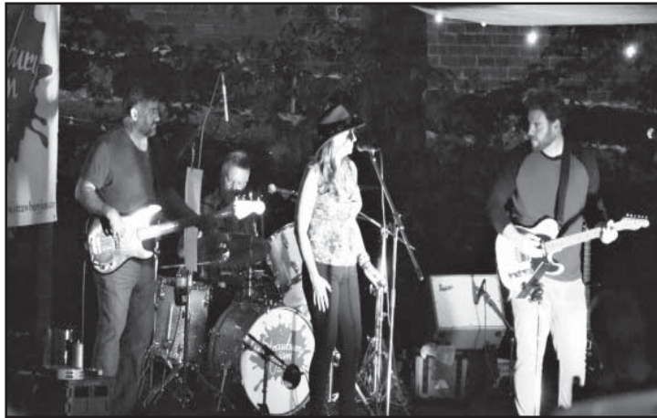
2021 TASTE headliner Strawberry Jam