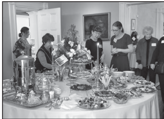
Tea attendees enjoy the sweet and savory treats served at the 2019 Holiday Tea

On Friday, December 3, we will be celebrating the 15th Holiday Tea & Fashion Show with a return to the Elston Homestead with a theme of “Sounds of the Holiday Season.” This event allows ticket holders a rare chance to see one of