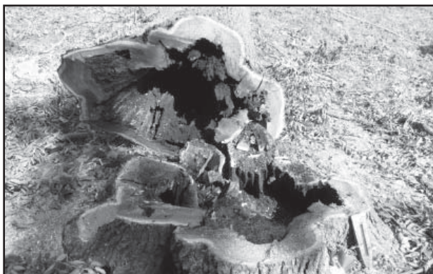
Hollow trunk of a walnut tree

The removal of the trees, located near the Carriage House, has changed the entire landscape. The shaded walkway from the Carriage House to the Study will be greatly missed. Henry's garden, filled with shade loving plants, will have to adjust to full morning sun. The